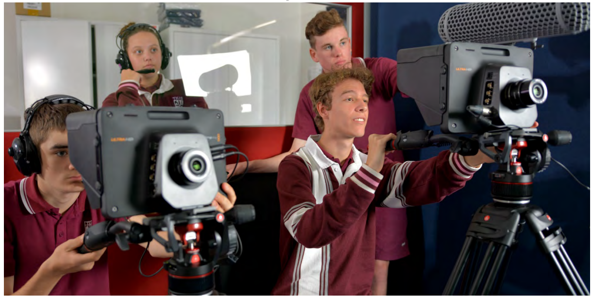
The use of Audio-visual lesson capture, broadcast and surveillance technologies at TKIS

Since 2019, the school has been operating a high-quality digital recording and surveillance network on campus and in most classrooms. The following is information relevant to this decision for parents/carers.